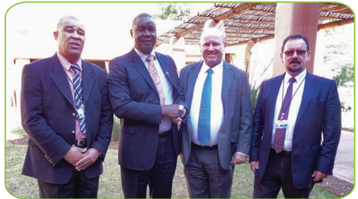
Symbolic welcome of Seychelles in RETOSA

Seychelles has been accepted as a member of RETOSA – the regional tourism organisation for Southern African countries – during the organisation's 46th meeting held in Livingstone, Zambia recently.