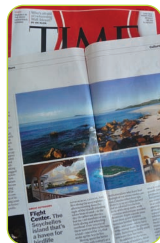
'Time' magazine dedicates article on Cousine Island

President James Michel recently announced that over 50% of the total land area of the country has now been declared as National Parks, making Seychelles the only country in the world to have achieved this level of commitment to the protection of their environment.