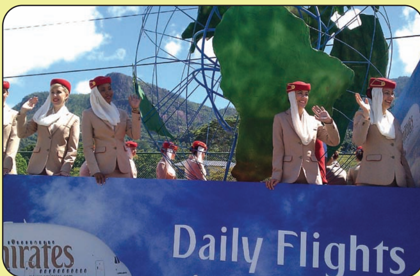
Emirates paraded in the 'Seychelles Carnival International 2011'

line with our commitment to promote the Seychelles across our network. Various tactical offers will be launched to support the programme with the aim of attracting more tourists into the destination.