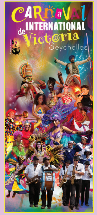
The Sevchelles Carnival brought the community of nations to Victoria

"Sevchelles is the host country for what is today regarded as the world's unique carnival of carnivals. We saw the need for all the countries of the world to be able to showcase their cultural groups, their achievements, their people and their uniqueness and this parading side by side with the best and the known carnivals of the world. This is why our carnival is so different and unique," he told the assembly.