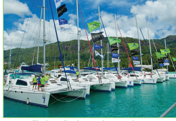
The boats lined up ready to race between the islands of Seychelles

with sailors in mind," Mr St Ange had noted at the official opening of the Regatta and many of the sailors and their crew have confirmed that the race around the islands of Mahé, Praslin and La Digue were the most pleasing.