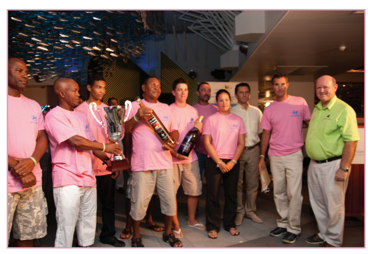
The Hyundai crew celebrate their victory